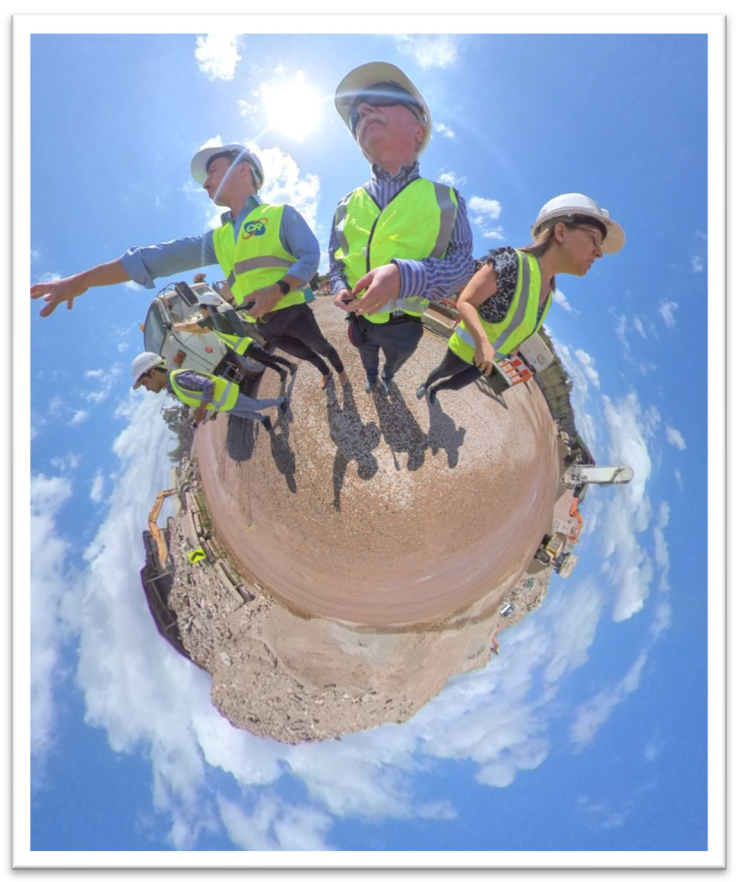
A tiny planet photo showing representatives from the University of Wollongong's sustainable building faculty visited Concrete Recyclers in February 2021 to better understand the principles of construction waste recycling.

It was reported to WCRA by Members that due to the significant volume of exported unprocessed scrap metal, to ensure there was adequate feedstock, NSW steel mills have imported scrap metal shipments from overseas.