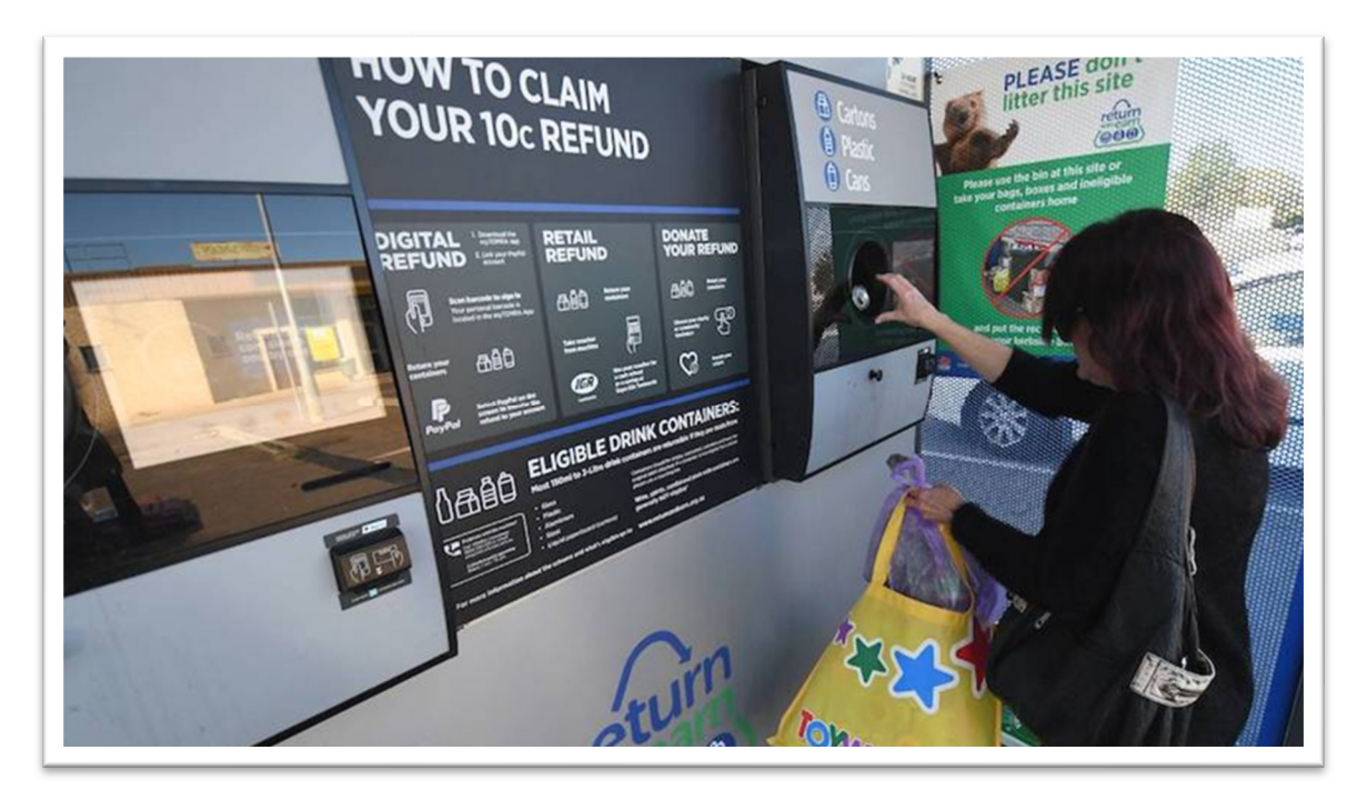
Members of the public support the conveniency of using the Return & Earn Vending machines. In return the quality of recycled material is very high.