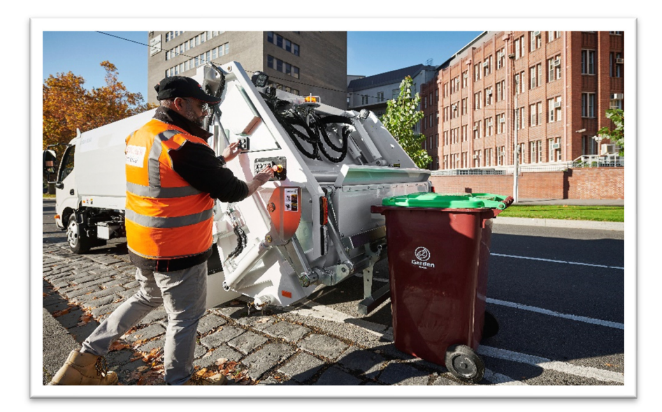
The new Bucher Municipal Urbin RL60, rear loader. 100% Australian made with best-in-class performance, versatility and reliability.

The implications of the China Sword recycling decision continued to trouble the recycling sector. To support the sector, WCRA continued to advocate for the Stakeholder Group to be reconvened. These requests were not acted on by either the EPA, DPIE or the NSW Government. WCRA and Members were firmly of the view that more needs to be done and appointed A. Prince Consulting to develop a strategy addressing AWT, CDS, MRF and recycling issues and a pathway forward. These matters continued to be a concern and this strategy was updated in March 2021.