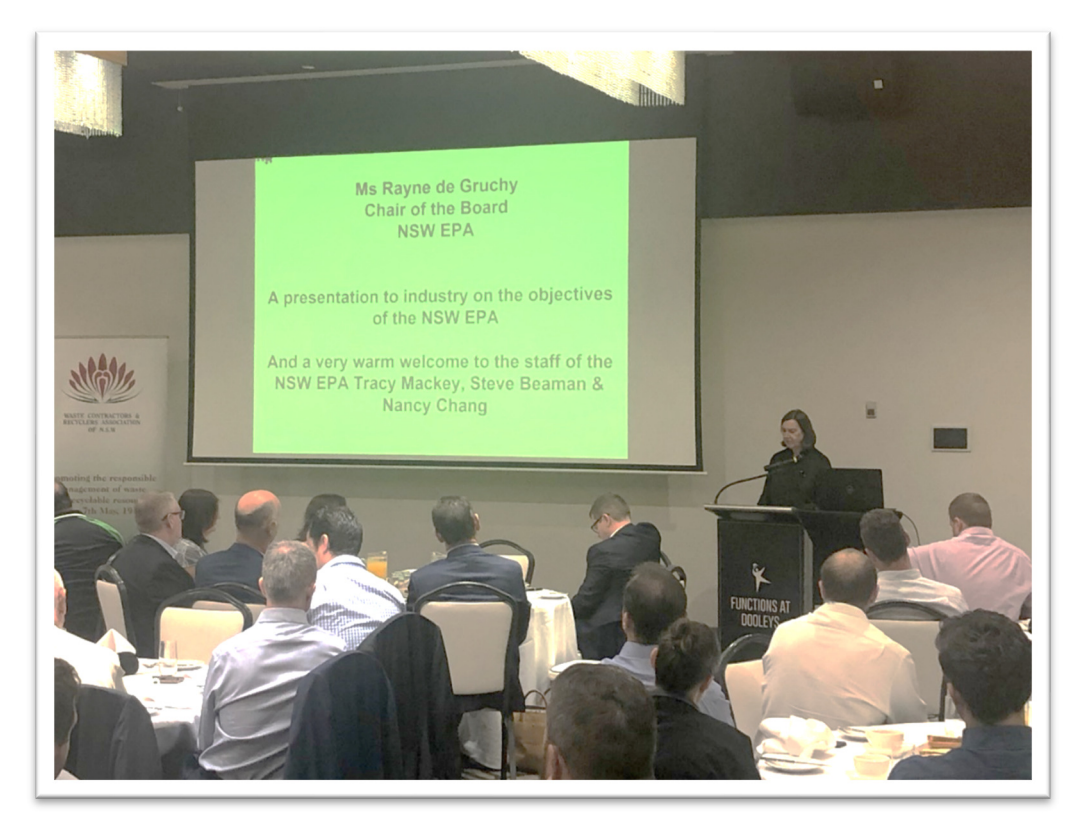
Breakfast Briefing held at Dooleys Catholic Club, Lidcombe