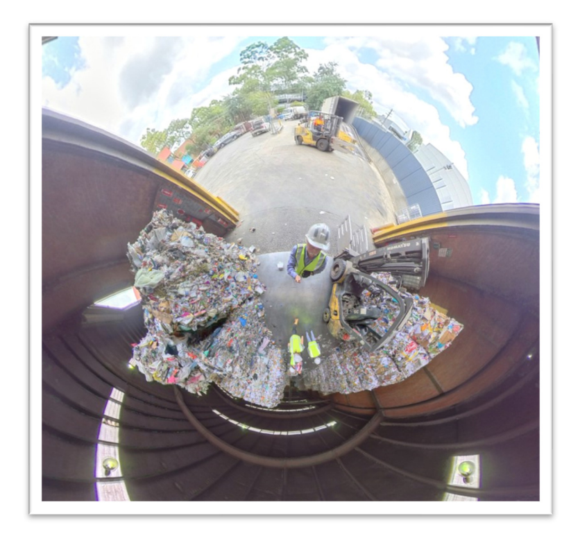
A tiny planet photo showing representatives from the University of Wollongong's sustainable building faculty visited Polytrade in February 2021 to better understand the principles of municipal recycling, including circular economy objectives.