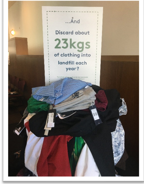
The statistics in support of consideration for the kerbside collection of textile waste recycling